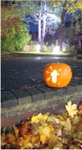
One of our pumpkins in the brightly lit car park