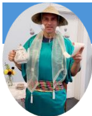
Our Fairtrade Genie