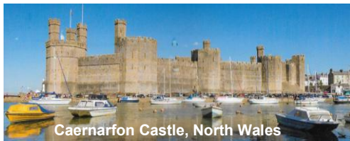
Caernarfon Castle, North Wales