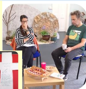
Our time included Communion