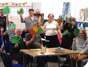
awing round our hands in the Morning Service artistically displayed for all to see.