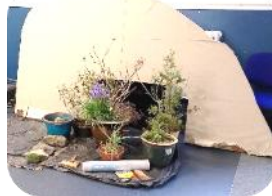
Our tired looking tomb about to get a make-over.