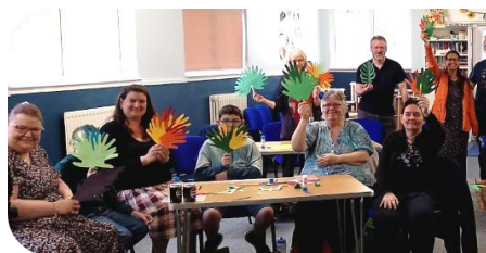
We made palm branches by drawing and cutting out paper, which were then attached to sticks.

We do have a very good God, and what a joy to celebrate His love.