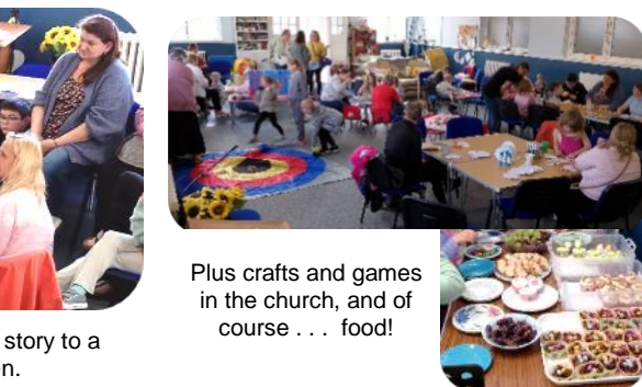
Plus crafts and games in the church, and of course . . . food!