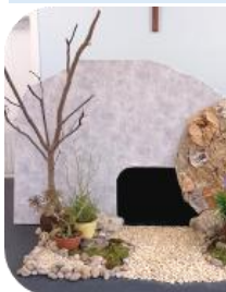
The focal point of our Reflections